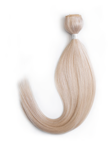
Clip In Halo

100% REMY RUSSIAN | 22 INCH 120 GRAMS | 150 GRAMS