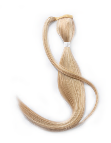
Clip In Ponytail

100% REMY RUSSIAN | 22 INCH 100 GRAMS | 14 COLOURS