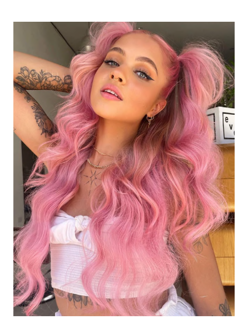
Facebook Jadore Hair Supplies